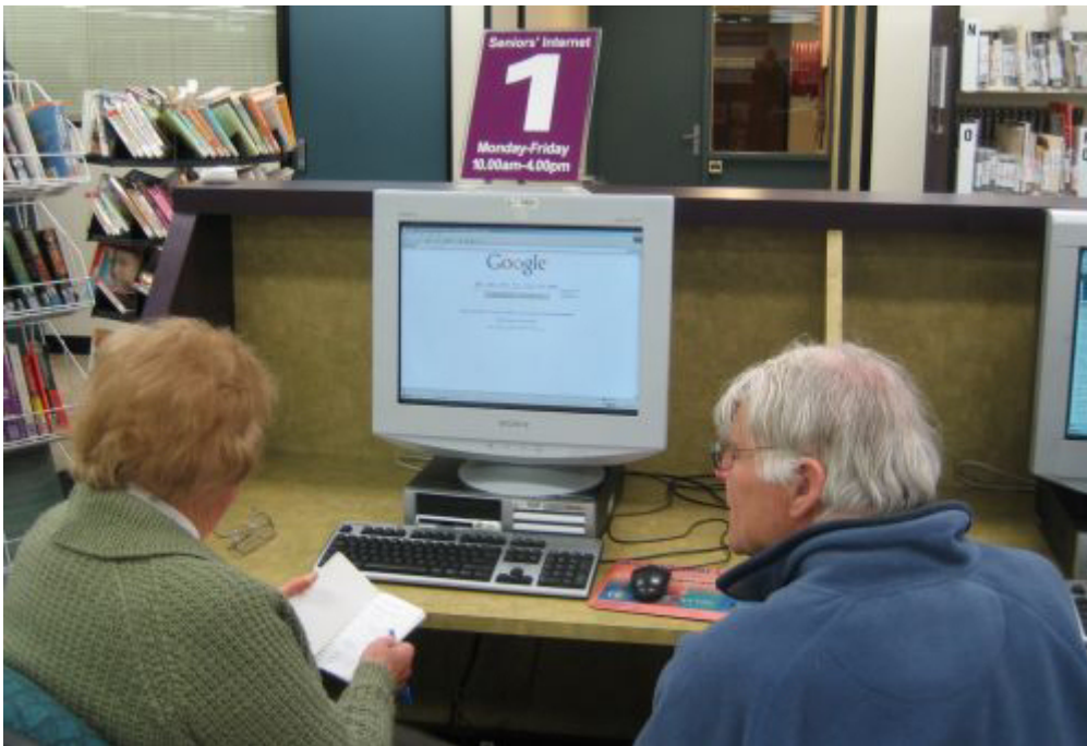
Student and Volunteer Instructor at a Seniors Terminal, Woden Library

The Woden Library staff promote the Seniors Internet program strongly and support it with two PCs dedicated to use by seniors. Each PC is connected to the library's broadband internet service and is loaded with Internet Explorer, Microsoft Word and Excel. The computers also have CD and floppy drives.